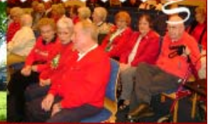
United Church of Christ