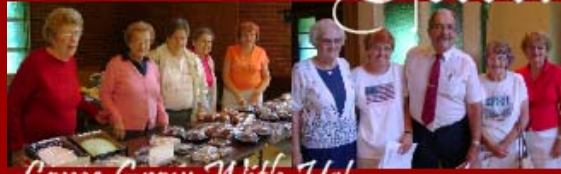
Come Grow With Us!