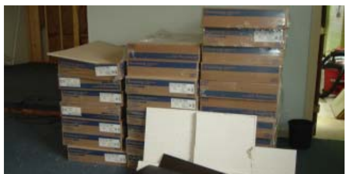
New ceiling tiles waiting to be installed.