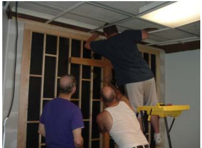
The framework is mounted at the back of the altar. Below, right, shows the altar before the background was mounted.