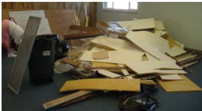
All the ceiling tiles had to come down.