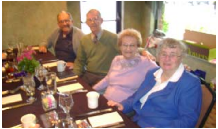
More photos on next page