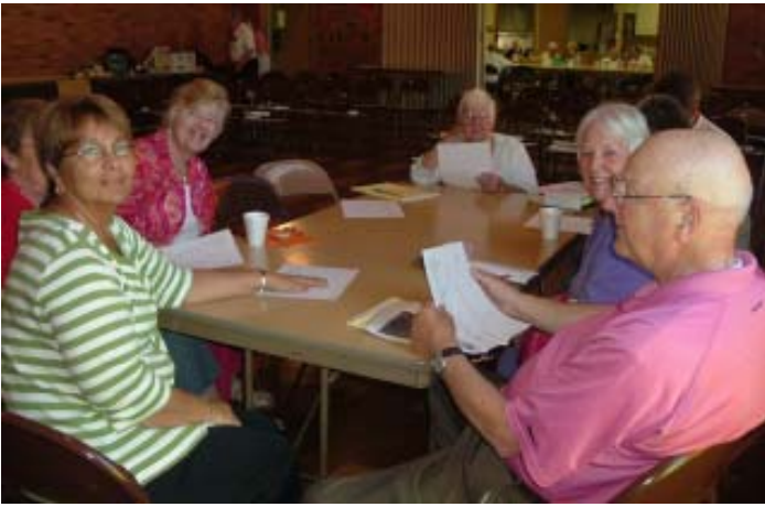
Council meeting to hear bids and vote on awarding various projects.