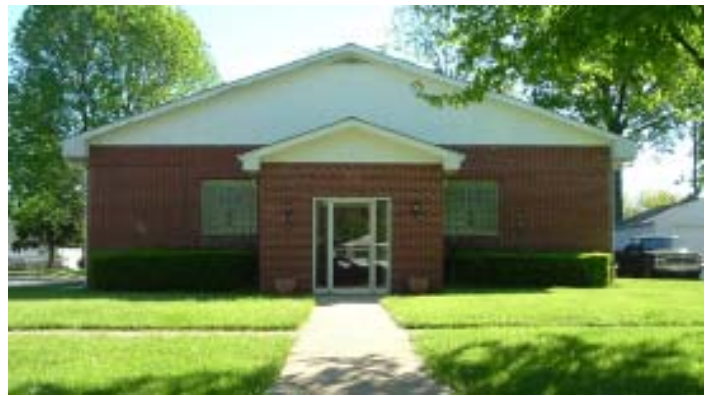
The building on Anderson Avenue before the work begins.