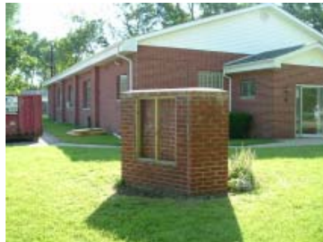
The structure completed. New signs will be installed soon.