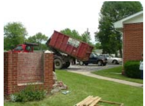
A dumpster was delivered to contain all the trash being removed.