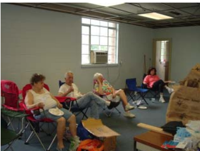
Taking a break for lunch in the sanctuary. This window, and all the others in the sanctuary, will also receive the stained glass finish, but a different design.