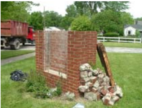
The structure for the signs under construction.