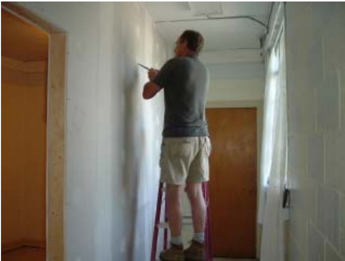
Cutting a hole high up on the new partition for a window to allow more light into the pastor's office.