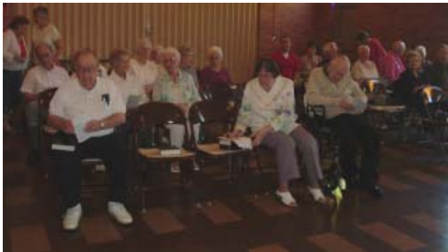
Faith Community meeting for services in temporary quarters at Heatherdowns Church of the Brethren.