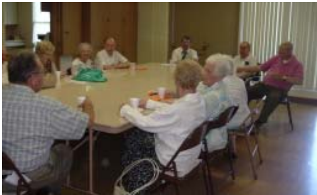
The Faith family enjoying fellowship hour following services at the Heatherdowns location.